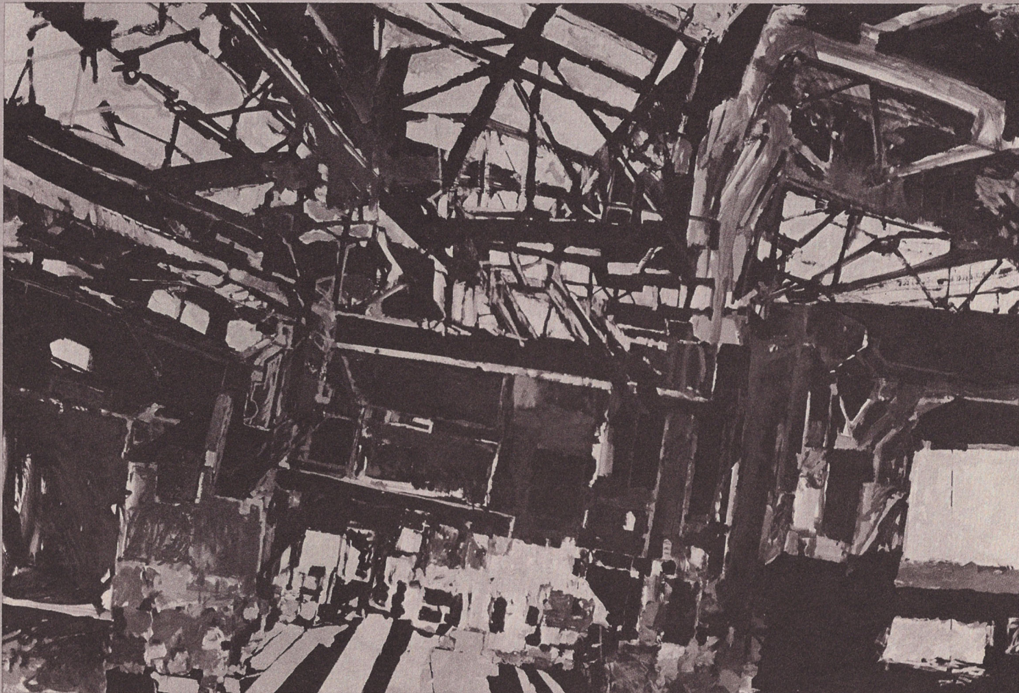
SHADOWS, 1974, 72 x 97 inches